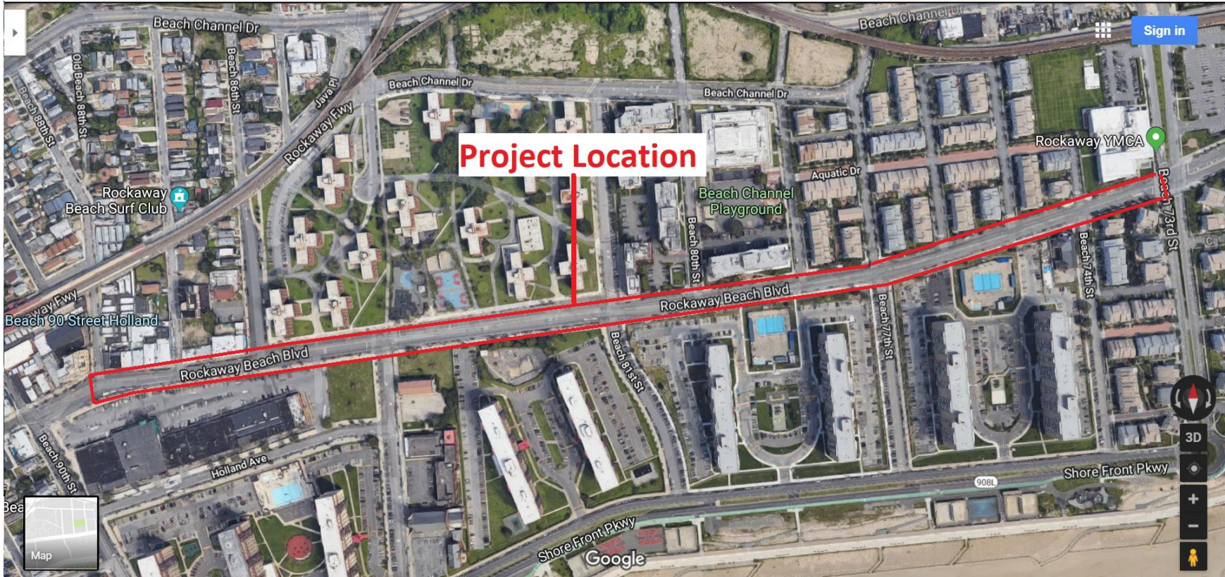
Figure 1. Project Location Map